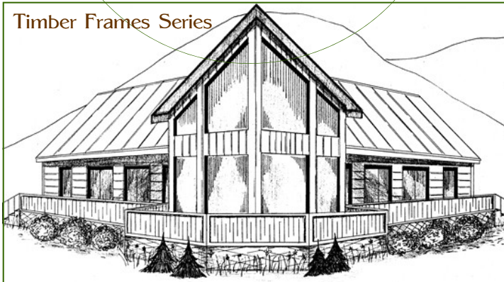
Timber Frames Series