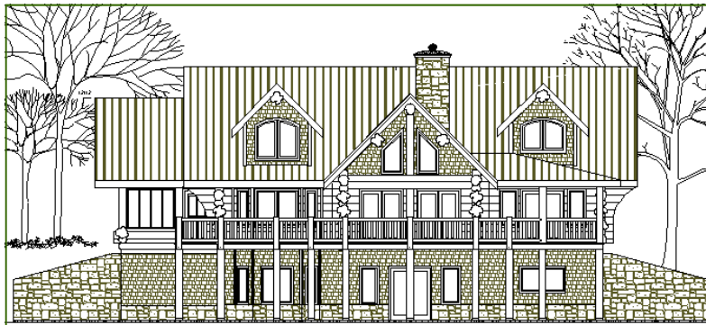
White Eagle Design